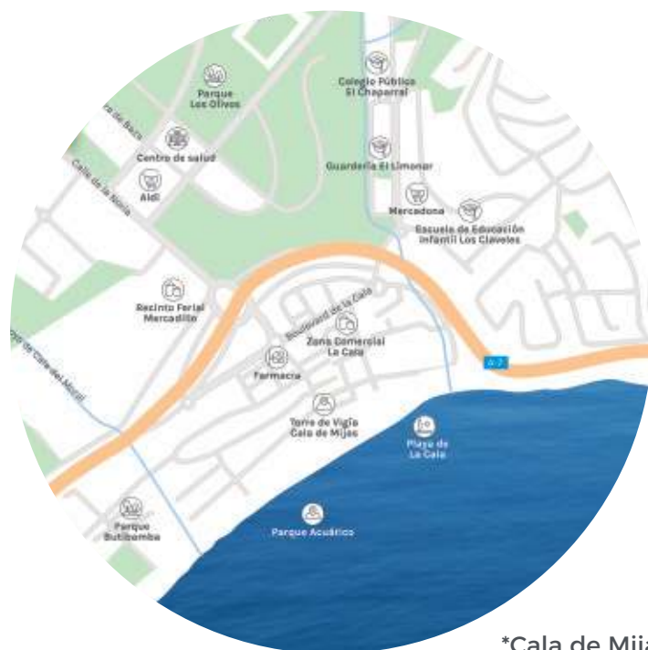
*Cala de Mijas

And just 30 minutes away are the airport and the city of Málaga.